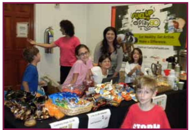
Our youth working their concession stand!